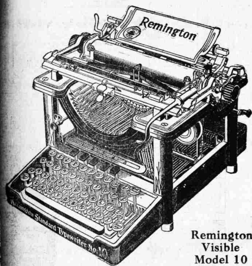
Remington Visible Model 10

The sales of these visible Remington models in the few years since they appeared on the market have been as unparalleled as their quality— surpassing by an immense total all previous records in typewriter history. Every month brings fresh Remington triumphs; every month adds thousands of satisfied Remington users; every month confirms the enduring supremacy of the