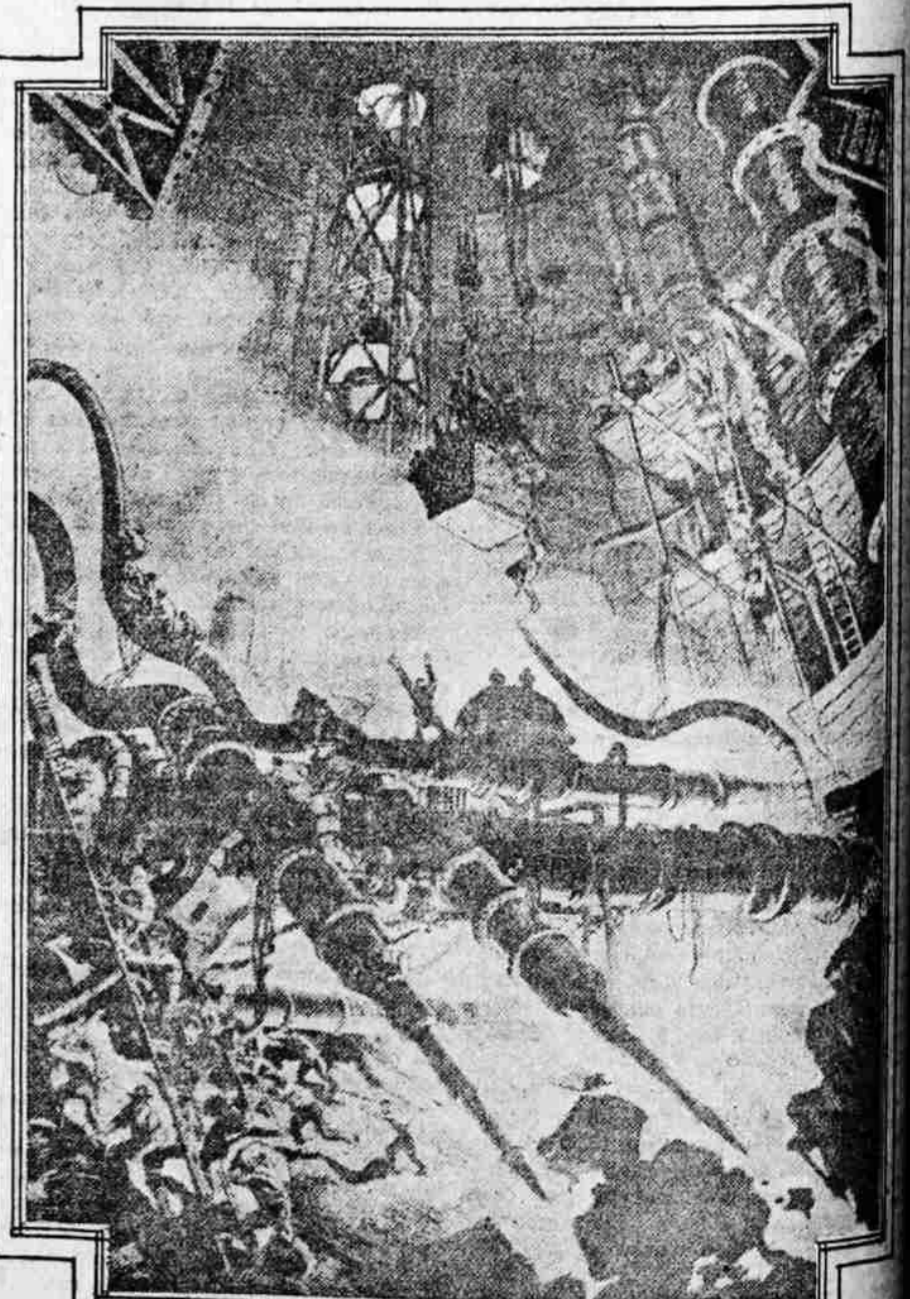
A Lanos Drawing of the Fighting Machines of the Martians in Wells' "War of the Worlds"—Giant Mechanisms Which the Luchy Inventions Somewhat Resemble.