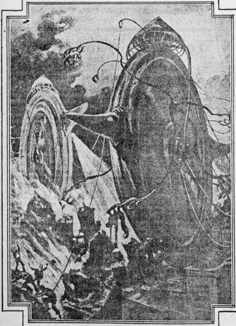
Striking the Earth's Internal Fires. A Drawing by Lanos, the Distinguished French Imaginative Artist, of the Great Bore Suggested by Camille Flammarion as a Means of Providing Heat and Energy for the Future.

movement, and so are not dependent upon their surroundings. In tropical countries, where locomotive travel is impeded by the vegetable growth, the machines can be equipped with cutting tools, and could clear a path to whatever point aimed at in a fraction of the time compared to the slow methods now in use. Finally their use as war engines, as terrible as the fanciful "walking tripods" of Mr. Wells's Martians, is being brought to the attention of the Italian Government. It is only fair to say that many scientists are skeptical as to the practicality of the machines. They grant that they will have limited use, but doubt if they can be extended to the deep sea walking size predicted by Dr. Luchy. Complexity of parts, weight and the enormous energy needed to run them on a large scale are put forth as arguments against their unlimited use.