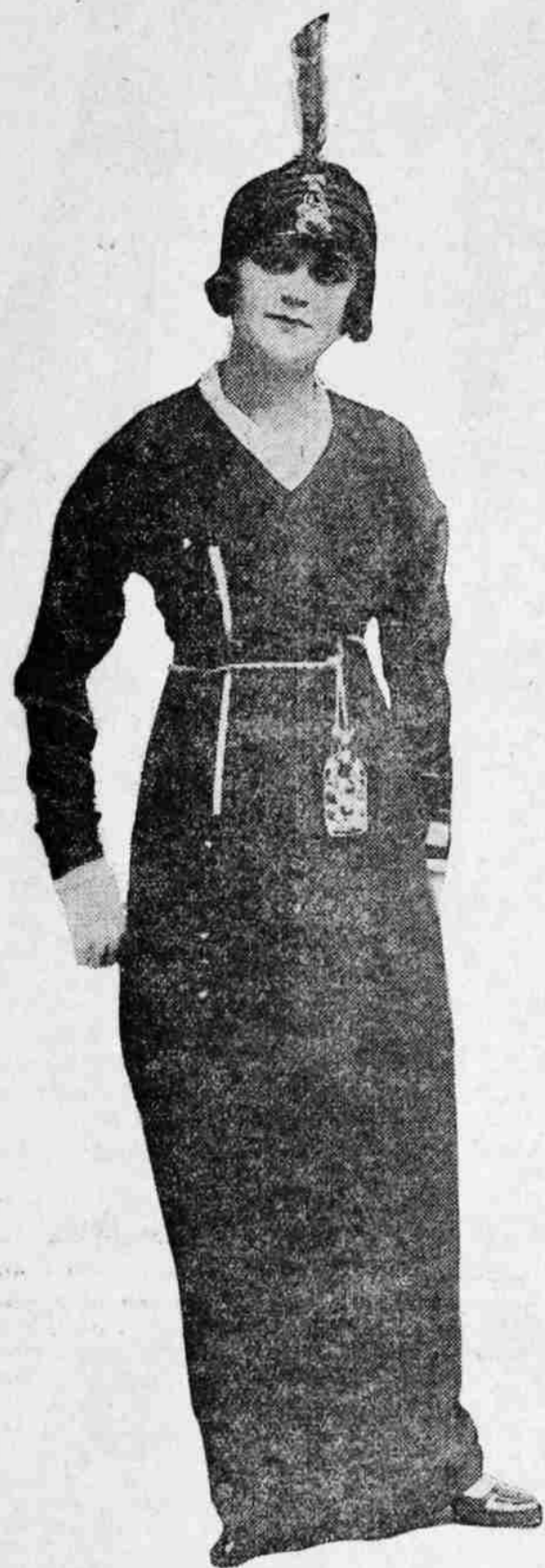
Cossack Costume of Blue Serge and Black Satin Designed by Lucile for a Trot-About Costume

Newest Fall Fashions Described by Lady Duff-Gordon.