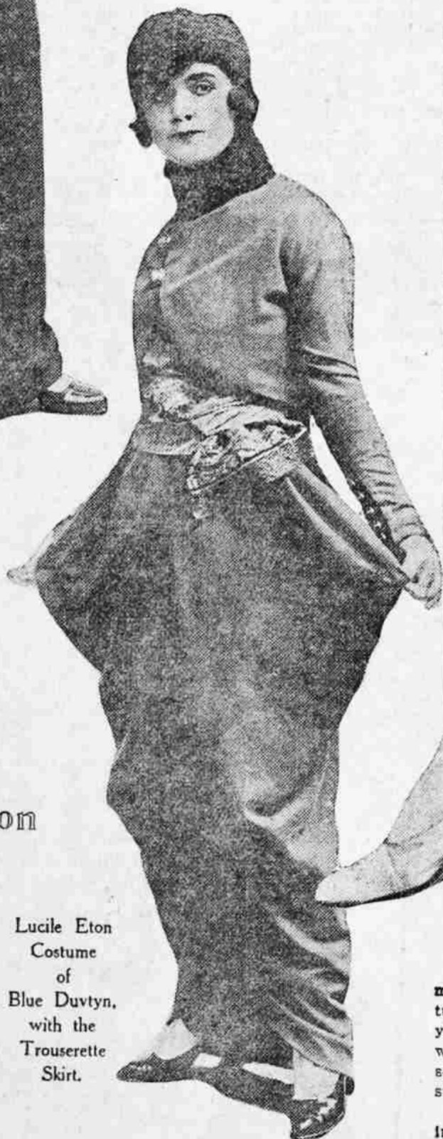
Lucile Eton Costume of Blue Duvtyl, with the Trouserette Skirt.