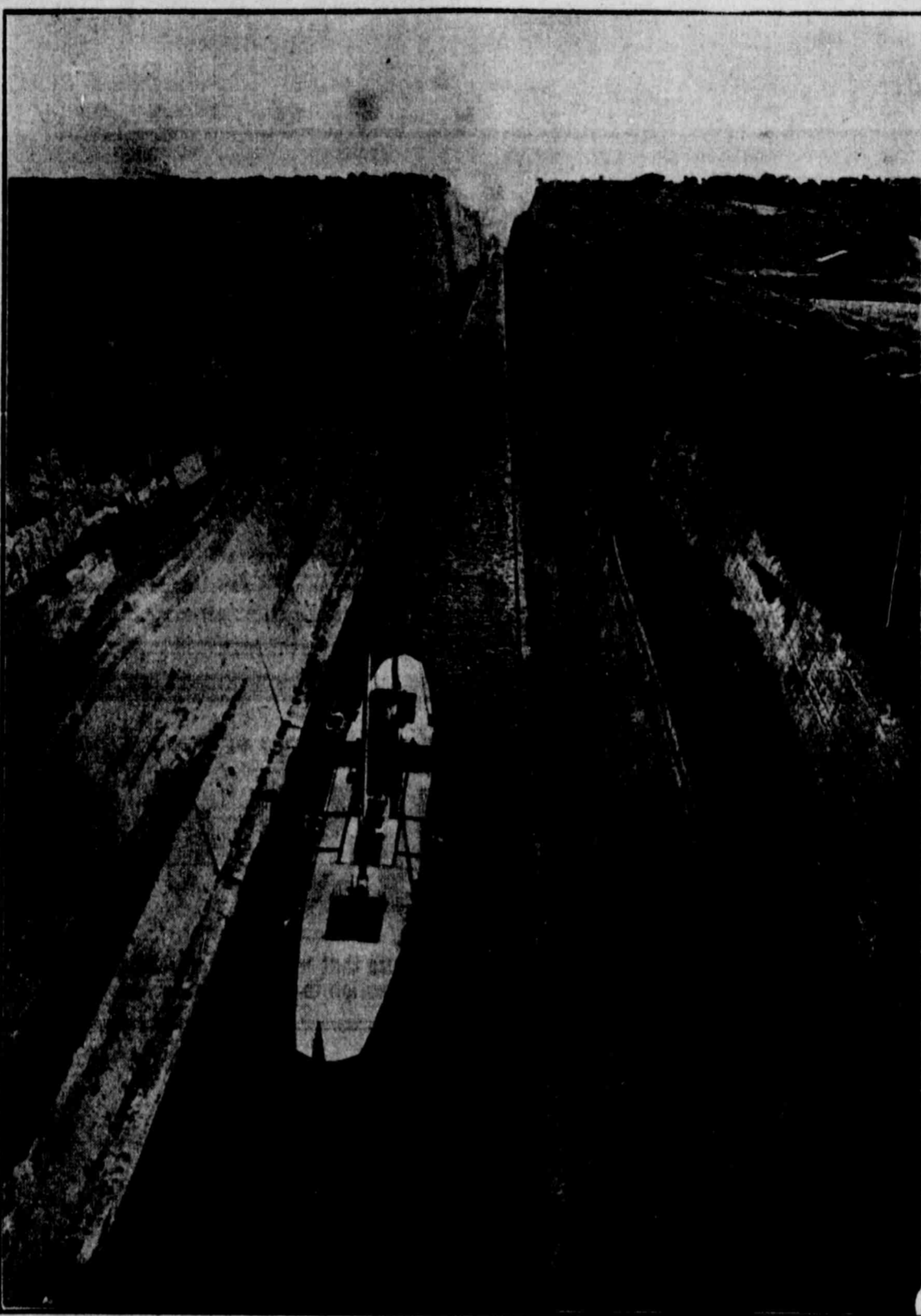
(From Stereograph Photograph for the Deseret News by Underwood & Underwood, N. Y.)

Passing Through the Corinthian Canal, a Remarkable Sea Level Waterway Connecting Saronic Gulf With the Gulf Of Corinth, Greece.