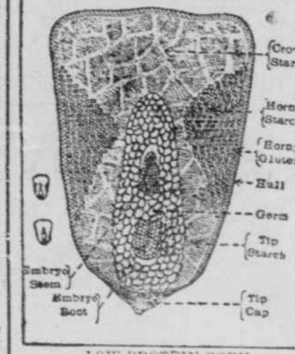
LOW PROTEIN CORN. While the proportion of protein in all forms is seen to be small. This can be determined by taking a sharp knife and cutting open several kernels of corn and making comparisons.