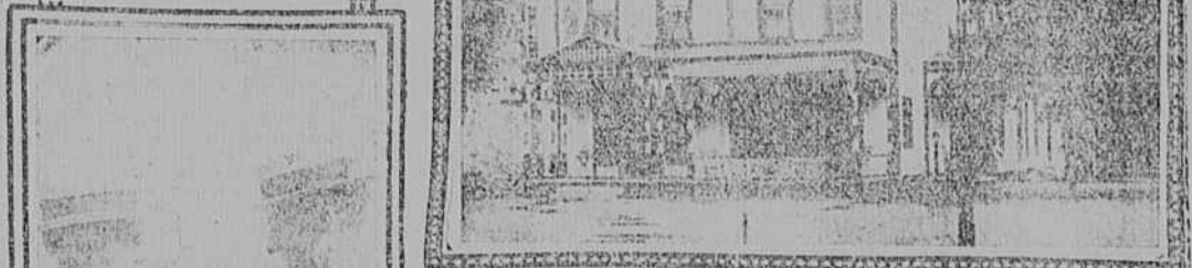
Home of Thomas R. Marshall, Democratic nominee for Vice-President, at Columbia City, Ind.