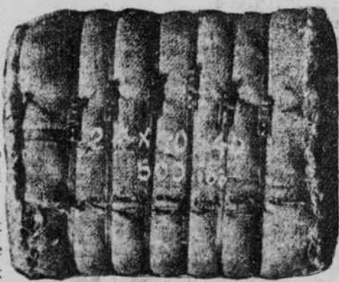
THE NEELY COMPRESSED BALE.

But this is but business. There is no other repair work depends alone!