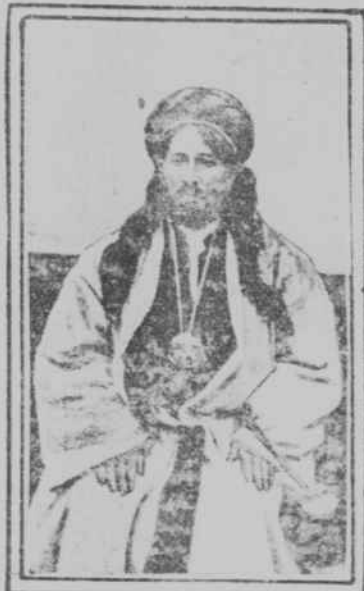
Type of Persian Voter.