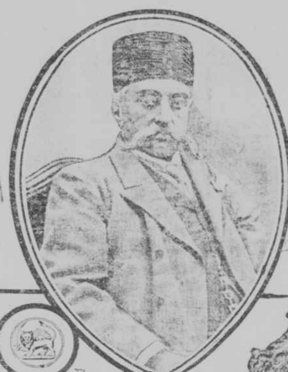
The Reigning Shah of Persia