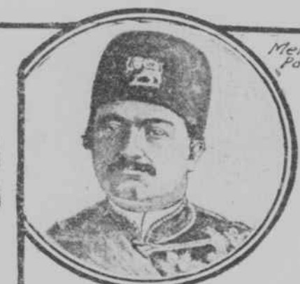
Mohammed Ali Mirza, The Shah's Heir.