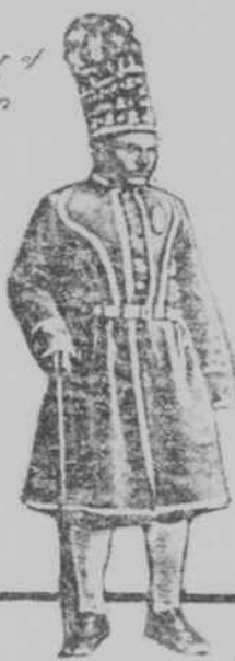
Outrunner of the Shah in uniform.