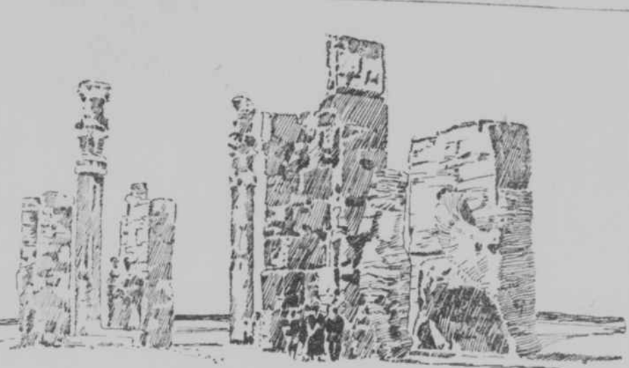
Memorials of Ancient Persia at Persepolis.