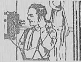
It's So Easy To Be Sure

W. W. Taylor & Sons BIG STONE GAP, VIRGINIA