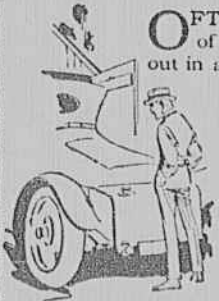
"Any U. S. Tire is a universal full money's worth."

OFTEN it's surprising the number of different tire views that come out in a chance talk at the curb or in the leisure of a friend's garage.