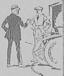
"The different tire views that come out in a chance talk."

Any United States Tire is a universal full money's worth—backed up with a leadership policy of equal quality, buying convenience and price for everybody.