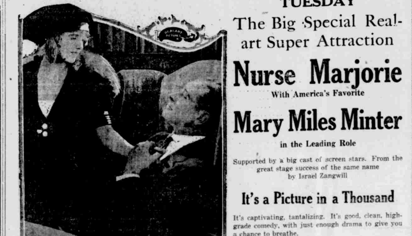
MARY MILES MINTER, NURSE MARJORIE REAL ART PICTURES

SHOWN AT THE REGULAR PRICES ALSO ADDED ATTRACTIONS TUESDAY — WANDA HAWLEY IN THE PARAMOUNT FEATURE MISS HOBBS ALSO THE NINTH EPISODE OF "THE LOST CITY," AND BURTON HOLMES TRAVELOGUE