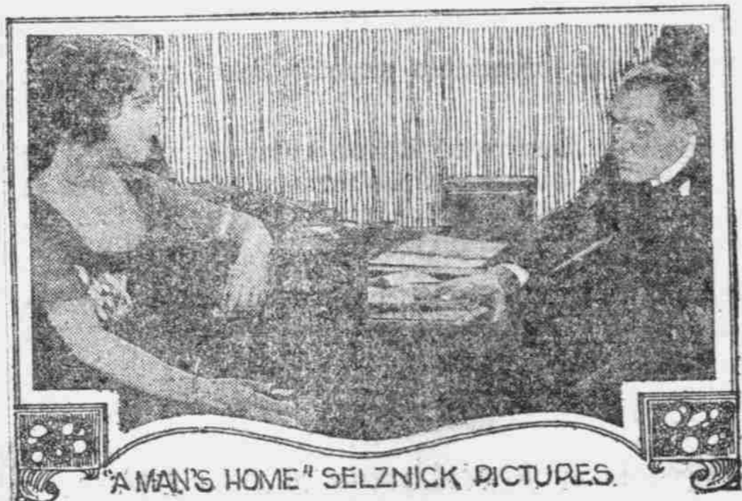
"A MAN'S HOME" SELZNICK PICTURES.