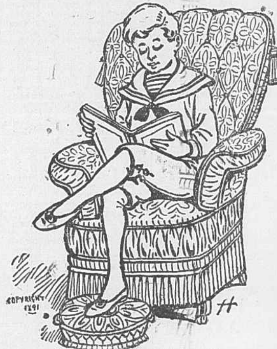
Any Person that Reads Knows that we Sell

HOUSE & HERRMANN—FURNITURE, CARPETS, ETC.