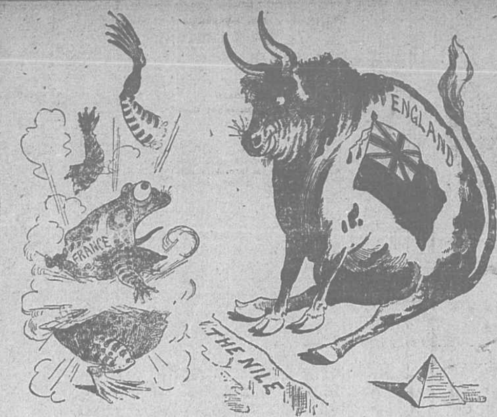
THE TABLE OF THE FROG AND THE BULL, UP-TO-DATE.

1. The court instructs the jury that “self-preservation is the first law of nature,” and that whatever a man may do to preserve himself from danger, he may do for another, especially for a near relative; that the “law of nature” is of Divine origin, that upon the strict obedience to the same depends all human happiness; that the laws of nature are so inseparably interwoven with the happiness of each individual that the latter cannot be attained but by observing the former; that if the former be punctually obeyed it cannot but induce the latter; that the laws of nature are coeval with mankind, dictated by God himself, and are superior in obligation to all others; that it is binding over all the globe, in all countries and at all times, that no human law is of any validity if contrary to “the law of nature”; that all human laws that are valid derive their force and authority from this original.