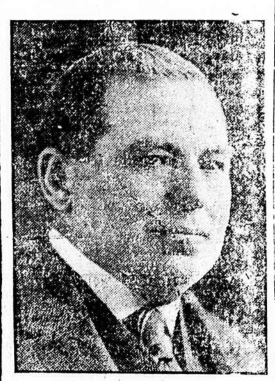
HON. W. G. BROWN.

REPUBLICAN NOMINATION FOR U. S. SENATOR.