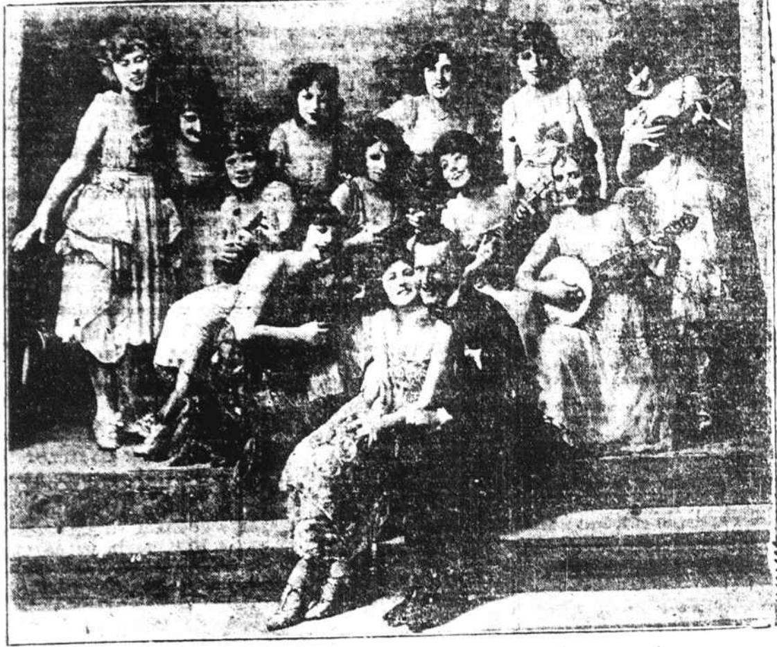
A scene in the up-to-date musical comedy, "Kissing Time," which will be presented at the Court Theatre, Tuesday and Wednesday nights, November 22 and 23.