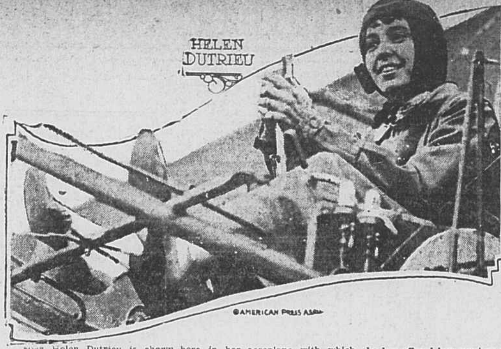
Miss Helen Dutrieu is shown here in her aeroplane with which she has offered her services as aviator in the United States army. She has just returned from France where she volunteered her services at the front. She is considered one of the world's best women aviators.

to abide by the rules of the campaign and all rulings which the Manager may make. Any candidate once nominated, and not wishing to continue in the Golden Festival must notify the Campaign Manager in writing within five days after the first appearance of such