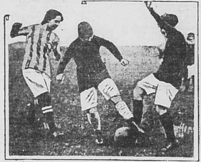
Girls of Edinburgh, Scotland, formed teams, donned soccer football tops and played recently for the benefit of a soldiers' and sailors' charity.