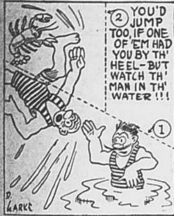
YOU'D JUMP TOO IF ONE OF 'EM HAD YOU BY THE HEEL—BUT WATCH THE MAN IN THE WATER !!!