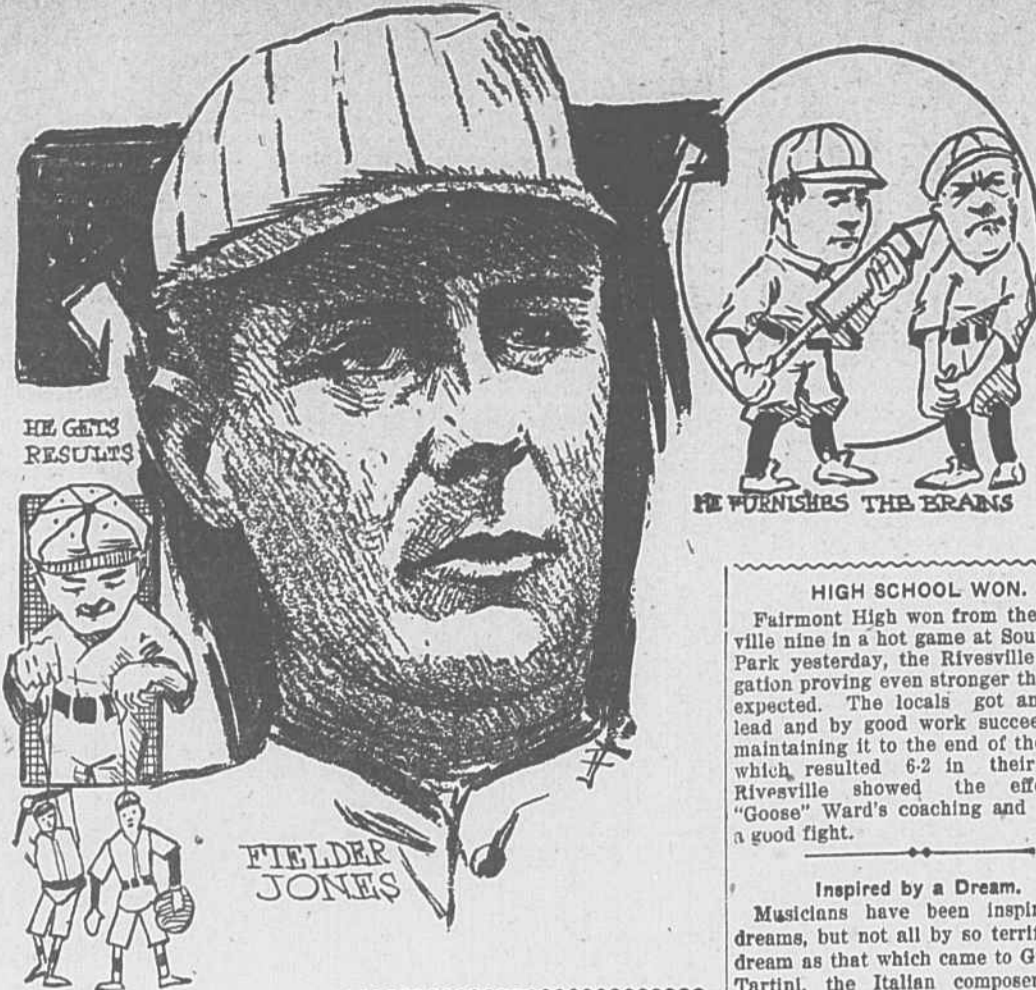
HE GETS RESULTS