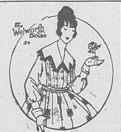
Pictured is One of the New Welworth Blouses at $2.00

Solid oak porch swings, 4 feet long, well made, finished in a good looking nut brown, with chains and ceiling hooks, complete, $2.35. Other styles of oak porch swings, 4 to 6 feet long, are priced $4 to $9.50. (Fifth Floor)