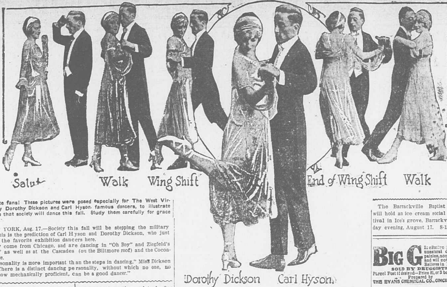
Dance fans! These pictures were posed especially for The West Virginian by Dorothy Dickson and Carl Hyson, famous dancers, to illustrate the steps that society will dance this fall. Study them carefully for grace.

NEW YORK, Aug. 17.—Society this fall will be stepping the military walk. This is the prediction of Carl Hyson and Dorothy Dickson, who just now are the favorite exhibition dancers here.