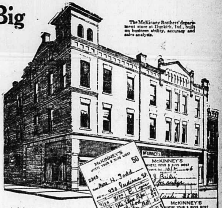
The McKinney Brothers' department store at Dunkirk, Ind., built on business ability, accuracy and sales analysis.

Every month the totals are transferred to a sheet showing comparisons with the same month in previous years.