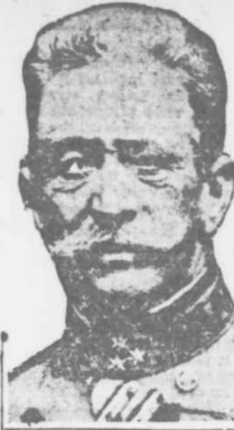
GEN VON HOETZERDORFF

This much-decorated Austrian general lost his job because of the failure of the Austrian drive against Italy.