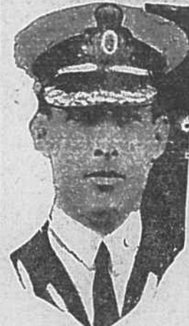
Crown Prince George, who has acceded to the Greek throne following the abdication of King Constantine, says he will make every effort to hold Thrace in Greek hands.

Special Service The West Virginian will receive a special baseball report each day over the Associated Press wire carrying the detailed play by play of the World Series games between the Yanks and Giants. The series opens at the Polo Grounds tomorrow. All games are played on the grounds and start at 3 o'clock. The West Virginian will have a full account of every contest except the one started on Sunday, when no report is taken at this office.