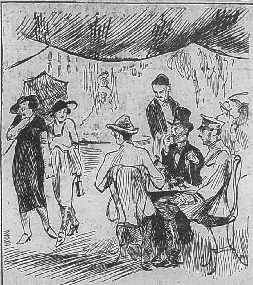
Officials from Washington investigate feminine styles in Cuba and discover the popular 'vamp' type is, well, almost...er... buxom.