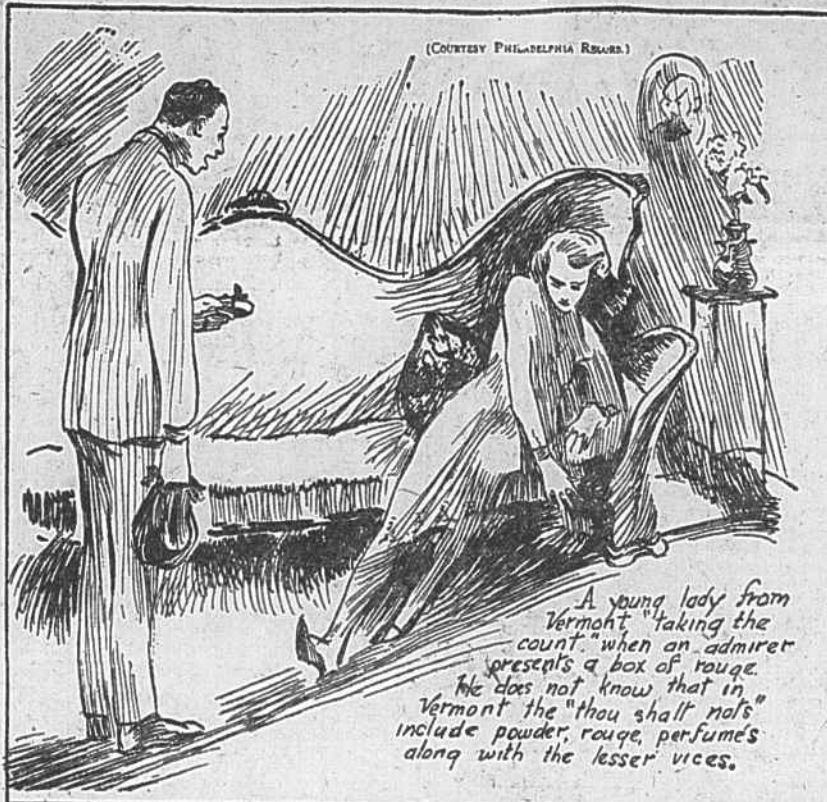
A young lady from Vermont, "taking the count," when an admirer presents a box of rouge. He does not know that in Vermont the "thou shalt nots" include powder, rouge, perfume's along with the lesser vices.

with soft curves. It was the difference between the Anglo-Saxon and the Latin ideal. American manufacturers had been trying to sell in Cuba gowns and coats built to accentuate the slender figure. The Cubans failed to buy. And the American fashion exporters lost money until the government got on the job. Then they began to win. Returning to the American women, the government data shows that she now is less extravagant than two years ago, despite the apparently tremendous sum she still insists on spending each year for beautifiers. That charming little habit of Miss Liberty—and for that matter, Mrs. Liberty, too—of powdering her nose at odd moments now costs approximately $50,000,000 a year, or enough to build the greatest dreadnaught afloat and leave more than $10,000,000 for a fleet of submarine chaser. The government now collects nearly $50,000,000 a year in luxury taxes on articles purchased mainly by or for women, like jewelry, candy, perfumes and cosmetics, face lotions and scented soaps, diamonds and powders and beautifiers of all kinds. The American woman since the war has taken to smoking cigarettes like her European sister, who long ago became as much of an addict to the weed as the European male. Tax receipts show that the sale of cigarettes in the United States has increased. During 1920, for instance, the number of ordinary sized cigarettes sold in the United States was 50,400,000. In 1913 the United States consumed only 14,000,000,000 cigarettes a year.