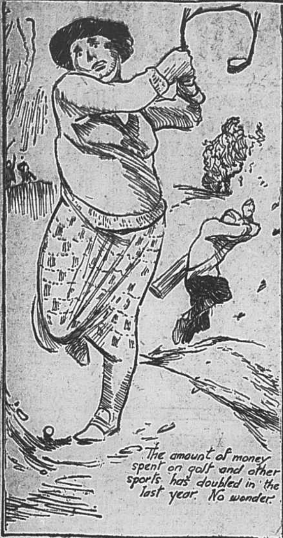
The amount of money spent on golf and other sports has doubled in the last year. No wonder.