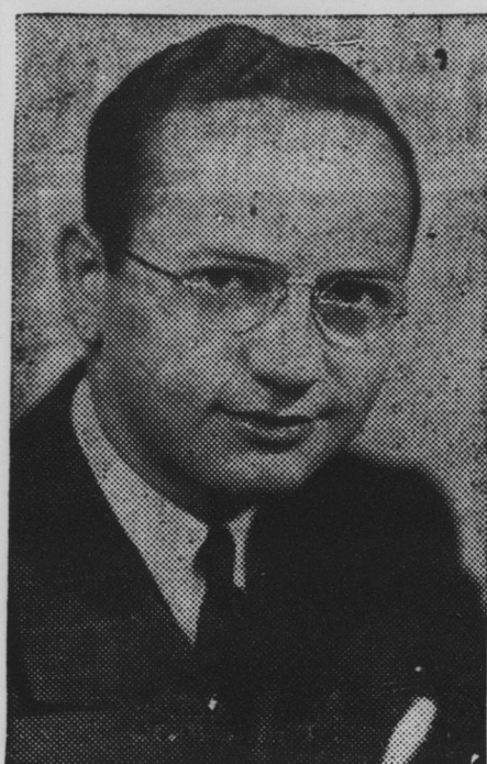
MAX F. BAER

Among middle - class Jewish families a secular college education is now considered as com-