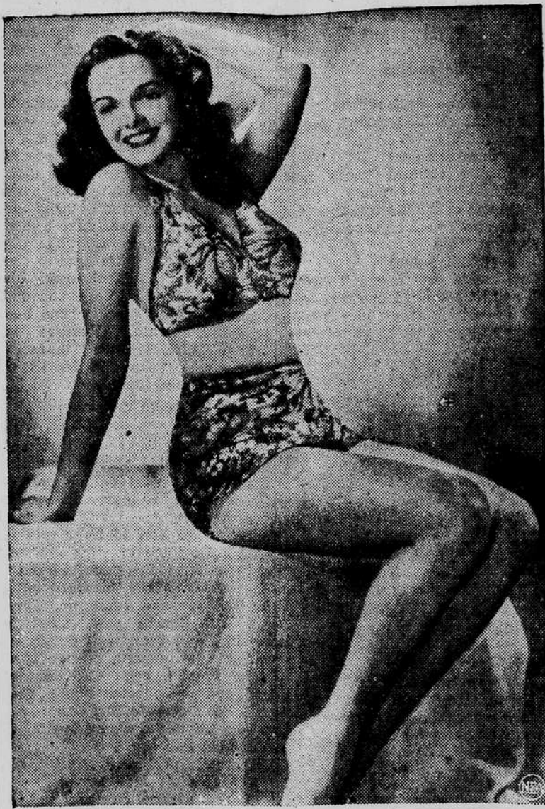
JANE RUSSELL: Kicking keeps her slim and trim.

Standing erect again, hands on the hips, feet together, swing the left leg out in front as high as you can. Bring the leg back to the floor and swing it straight out to the side as far as possible. Alternate with the right leg 15 times, and gradually increase to 25 times.