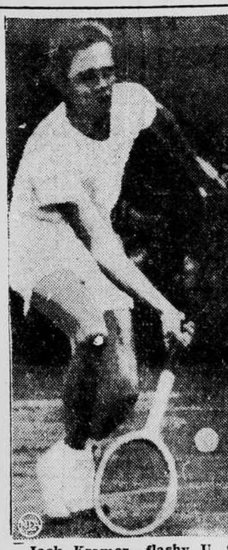
Jack Kramer, flashy U. S. netman, was upset Friday in the all-England tennis championship when a Czech dark horse, Jaroslav Drobny licked him in a terrific tow and one-half hour match, 6-2, 17-15, 6-3, 3-6, 6-3.