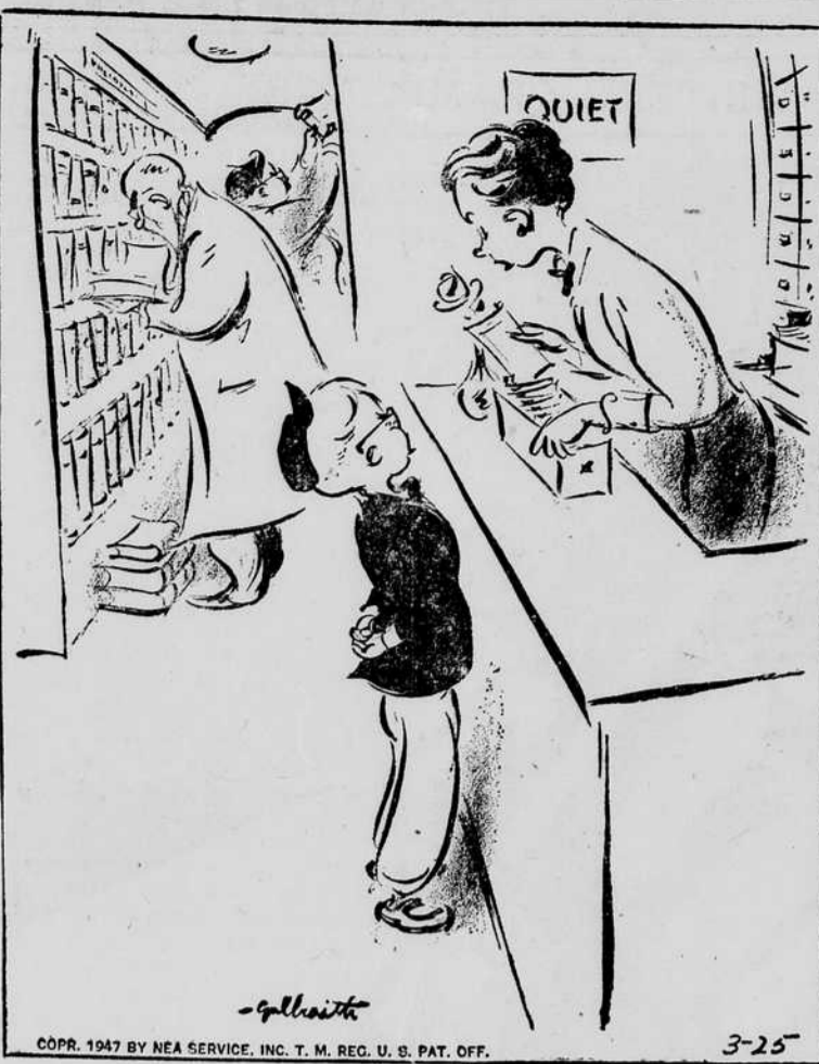
"Have you a good book on psychology? I want to find out what's the matter with my parents!"

Do you feel bloated and miserable after every meal? If so, here is how you may rid yourself of this nervous distress. Thousands have found it the way to be well, cheerful and happy again. Everything food enters the stomach a vital gastric juice must flow normally to break-up certain food particles; else the food may ferment. Sour food, acid indigestion and gas frequently cause a morbid, touchy, fretful, peevish, nervous condition, loss of appetite, underweight, restless sleep, weakness.