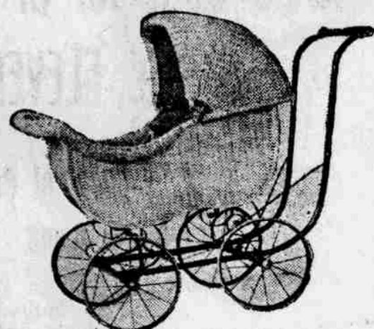
BABY CARRIAGES, FOLDING GO-CARTS AND SULKEYS FROM $1.25 TO $35.00.

Owing to the miserable weather the past week or more, we now have a special sale of everything mentioned below.