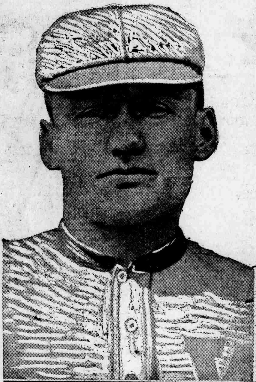
... JOHNSON ...

Before the present baseball season opened alarming reports came from Washington that Walter Johnson had a sore arm. Judging from the way in which the big pitcher has been