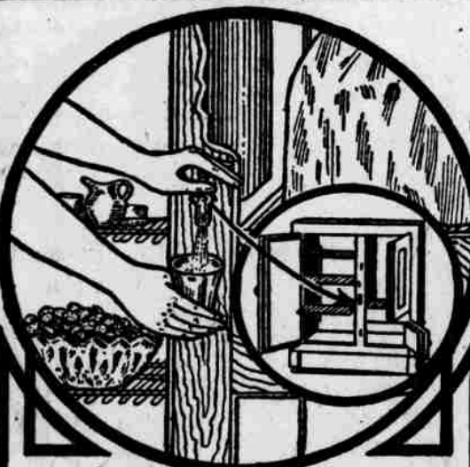
Delicious Cold Water Always On Tap In The AUTOMATIC REFRIGERATOR With The Built In Water Cooler

REFRIGERATORS. 100 to select from. "Odorless," "New Leader," "Snow White." Come and look them over.