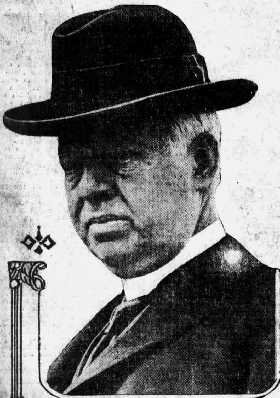
JUSTICE JOSEPH R. LAMAR

Niagara Falls, Ont., May 30.—Justice Joseph R. Lamar of the United States supreme court is the dominant figure in the A. B. C. peace conference. Justice Lamar has from the first taken the leading part in attempting to straighten out the tangled