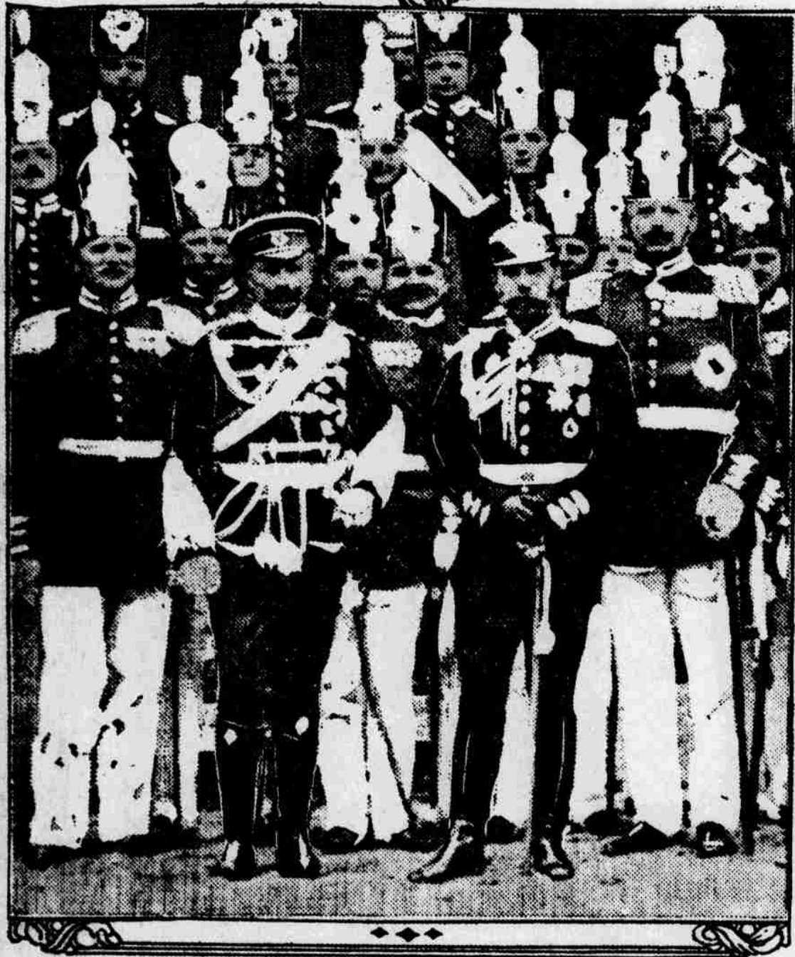
KAISER and CZAR with STAFFS

This picture shows the kaiser and the czar standing together surrounded by some of their staff. It is interesting because they were friends then. Now they are fighting each other and have set all Europe afire.