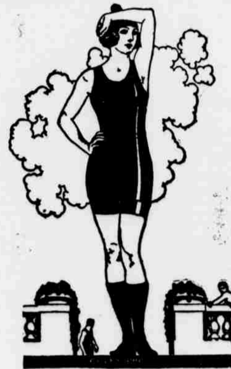
Copyright 1922, Jantzen Knitting Mills

We have them in a variety of sizes and colors for