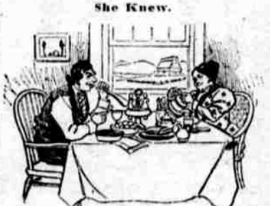
She Knew. Hiram (describing his trip to Lon- don)—I went into the stores and got in one of them things that take you right up to the roof in a jiffy—what d'yer call 'em, Marthy? Marthy—Them's shop lifters—Nug- gets.

The beauty of a picture as a present is that when it be- comes a part of the home it hangs in the memory forever, such is its influence. King Bros. have them, all sizes, prices and kinds.