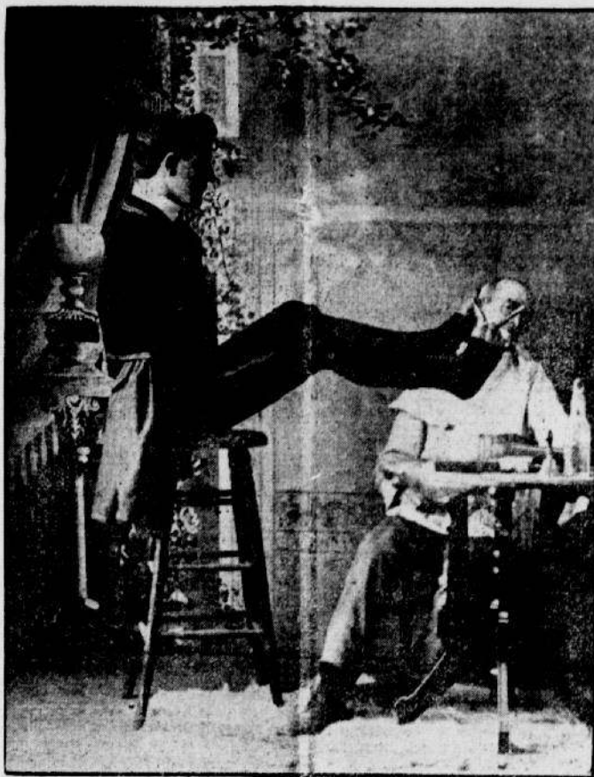
HE SHAVES A FRIEND.