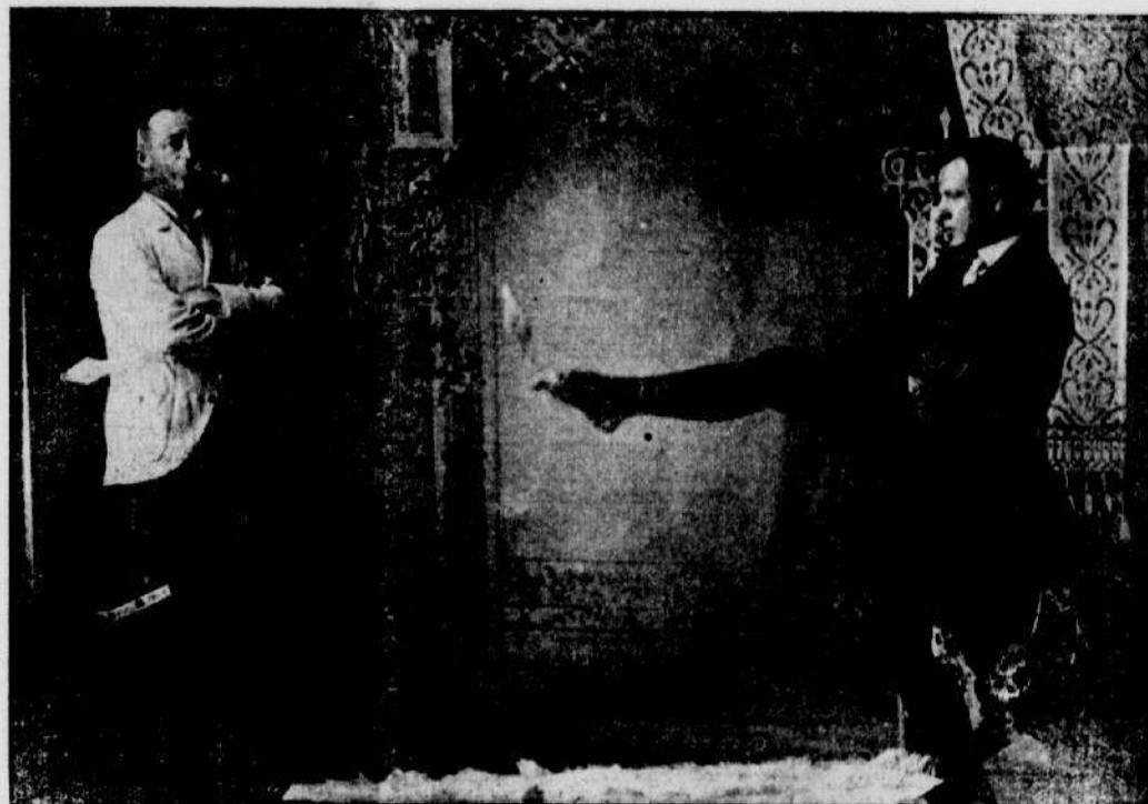
THE ARMLESS WONDER PERFORMING A DEXTEROUS FEAT.

With His Gun in His Foot, Enters Rooms of the California Club and Secures Coin--Shaves Himself at the Station When Arrested