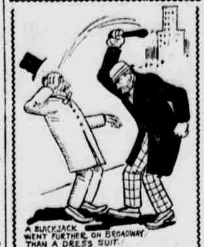
A BLACKJACK WENT FURTHER ON BROADWAY THAN A DRESS SUIT.