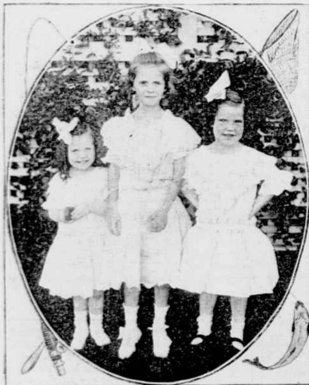
THREE LITTLE MAIDS WITH THE SUN IN THEIR EYES.