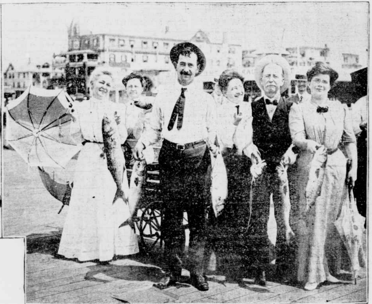
A JOLLY FISHING PARTY.