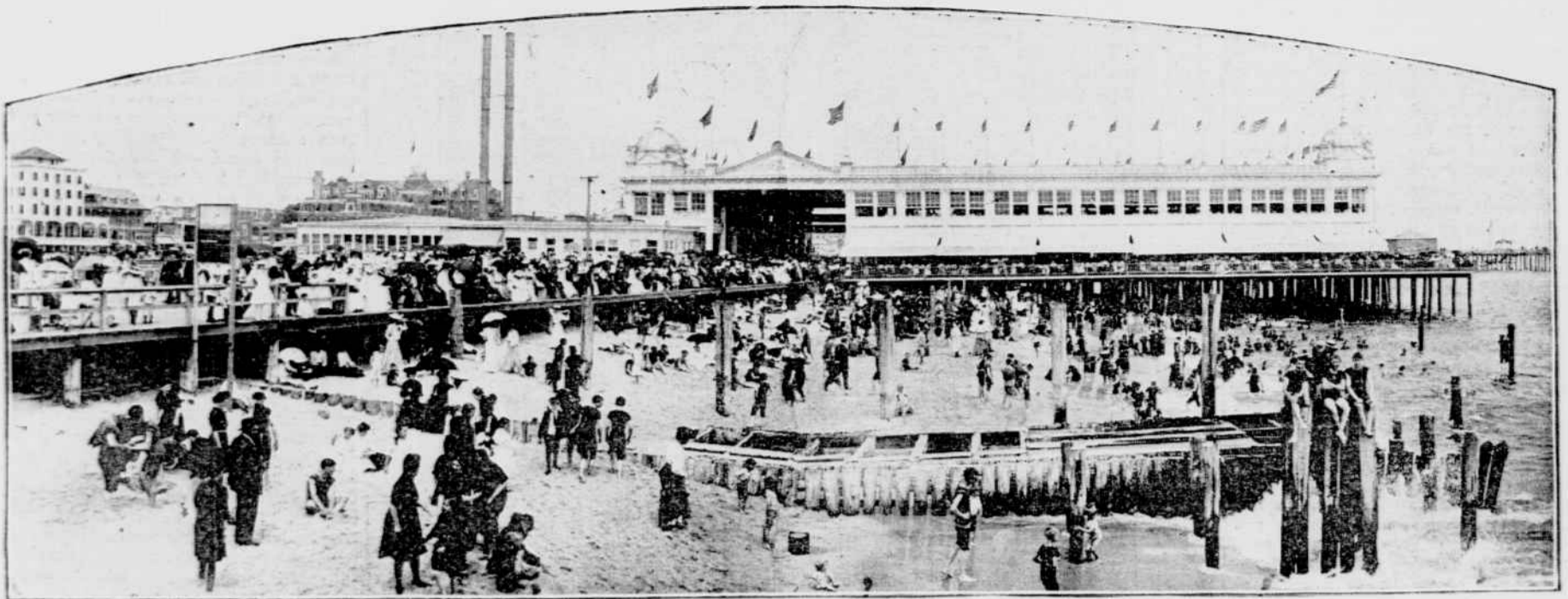
ON THE SWIMMING BEACH.