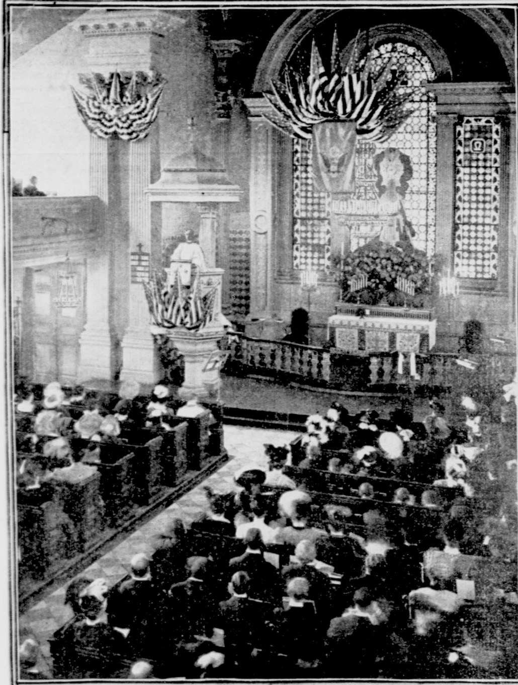
AN ANNIVERSARY CONGREGATION IN ST. PAUL'S LAST WEEK.