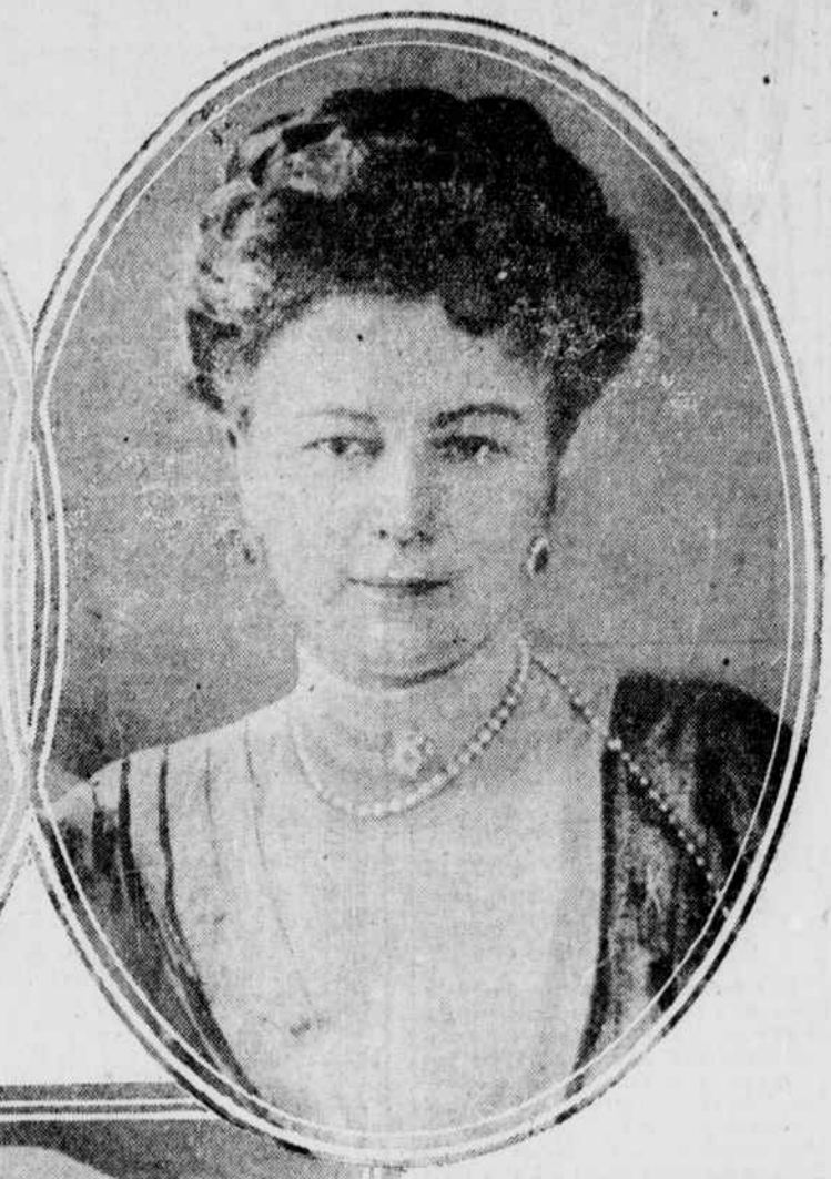
THE DUCHESS OF HOHENBERG.

Mexico City Told That Chihuahua Has Been Retaken. (By Cable to The Tribune.) Mexico City, June 28.—General Blanquet, Minister of War, affirmed to-night that Chihuahua City had been recovered for the government by a counter revolution, and that Villa and Angeles, instead of advancing on Aguas Calientes, had started in all haste northward to save themselves from being cut off from their base. Zapatas, who have been active in the valley of Mexico, are reported dispersed and danger from them is depleted and Porte is sure that the at-