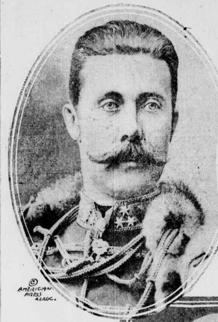
ARCHDUKE FRANCIS FERDINAND.

HEIR TO THE AUSTRIAN THRONE AND HIS WIFE, VICTIMS OF ASSASSIN.