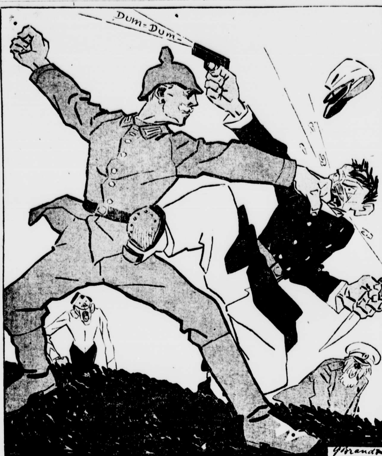
THE TRIPLE ALLIANCE.

The articles and other matter printed here come from leading German periodicals and other sources friendly to the cause of Germany in the war. They are published in order to present to the readers of THE SUN the German side of the questions now in controversy between the leaders of thought of the hostile nations, thus giving them an opportunity to form impartial opinions of the issues. THE SUN assumes no responsibility for any of the statements made or opinions expressed.