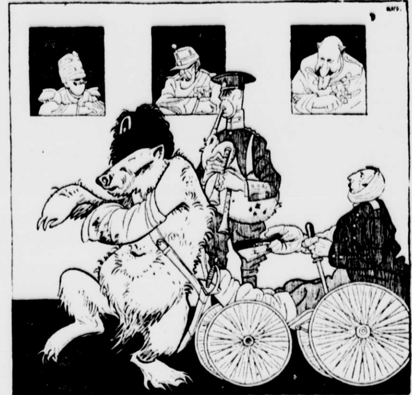
The begging trio. The neutral countries are praying inwardly to take part in the exhibition. The proceeds will be divided. Copyright by Stupfismus.