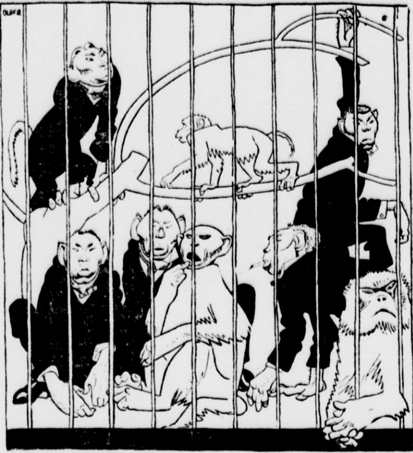
There is where they belong. We suggest that any Japanese found in Germany be put in the Zoo. But the chimpanzees object.