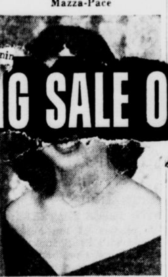
After graduating from Shaw, the bride was graduated from Kent State University and the bridegroom was graduated from Ohio Wesleyan University where he was a member of Sigma Phi Epsilon.

A reception at the church followed the ceremony. The couple took a wedding trip to the Poconos.