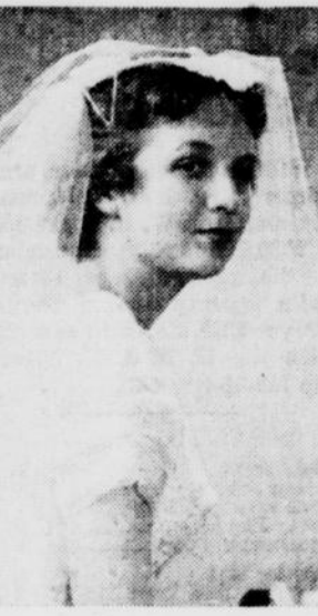
Alecon lace and seed pearls. She carried a cascade of white sweetheart roses and phillips orchids intertwined with miniature ivy.

The bride wore a chapel length short skirted sleeve gown of pure silk organza with a princess style front and a panel of Alecon lace and a large bow in the back. The sabrina neckline was also Alecon lace and was beaded with seed pearls. Her finger tip veil had an open shell headpiece of