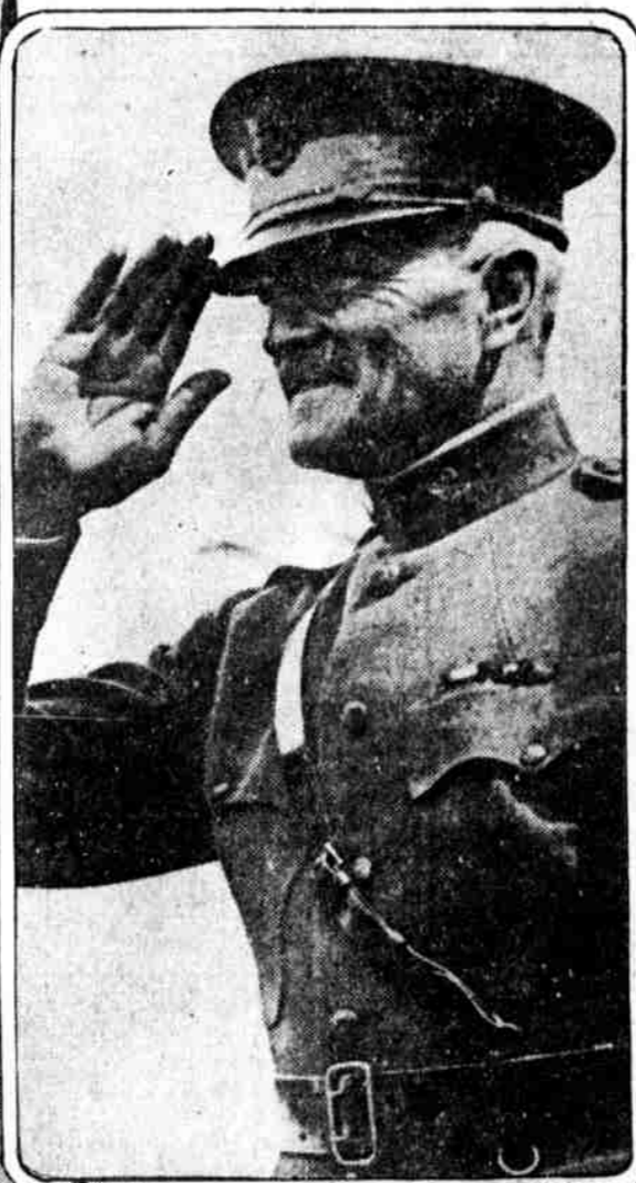
GENERAL JOHN J. PERSHING, commander of the American expeditionary forces, has said farewell to France and has sailed on the transport Leviathan for the United States.