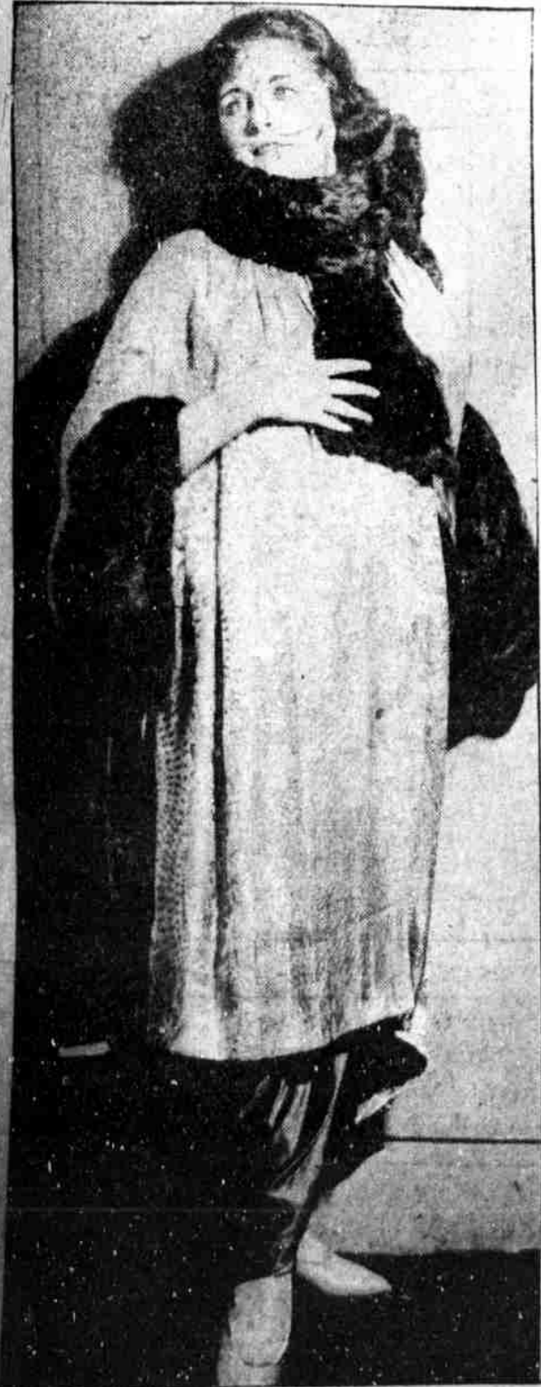
EVENING WRAP of brocaded silver and blue. Collar and cuffs are of Belgian hare.