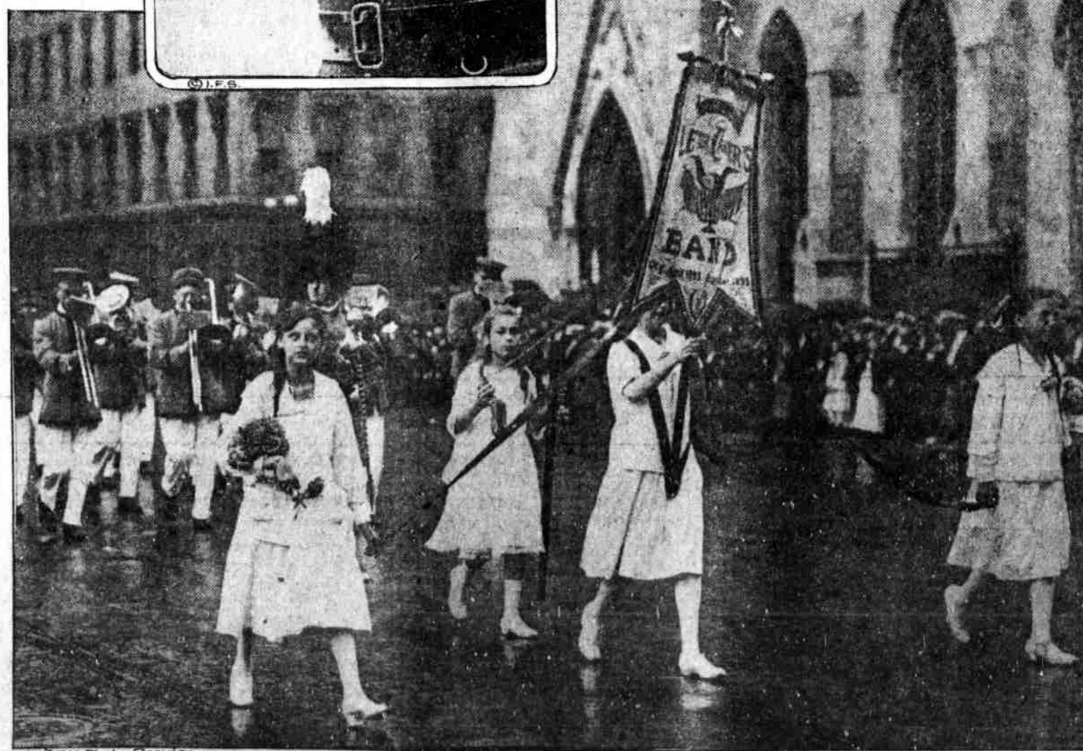
FAIR YOUNG standard bearers who braved the showers and paraded gayly throughout the line of march in the procession of letter carriers holding their annual convention here.