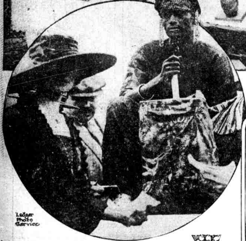
Ledger Photo Service