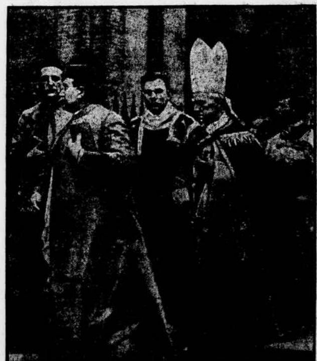
Diplomatists from 15 nations attended a mass at St. Stanislaw's church, New York, for G. Narutowicz, Poland's assassinated president, at which Archbishop Hayes (second from left) officiated.