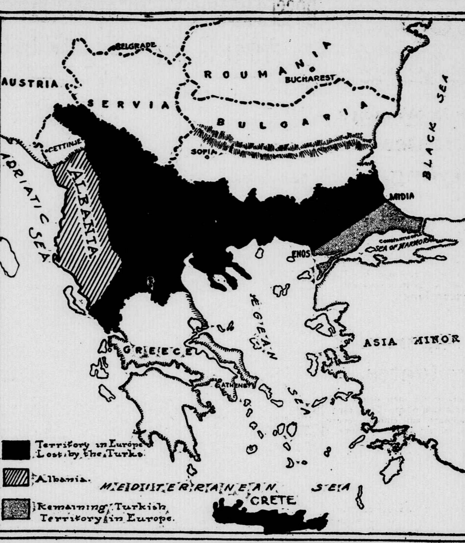
MAP SHOWING DIVISION OF TERRITORY PROVIDED FOR IN THE TREATY BETWEEN TURKEY AND THE BALKAN STATES WHICH HAS BEEN DRAFTED FOR THE CONFERENCE IN LONDON.