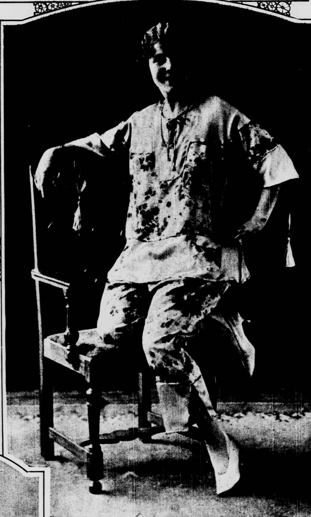
"Sweetbriar" boudoir pajamas, the very newest idea in fashions. The costume gets its name from the color design, and the material is satin panne.