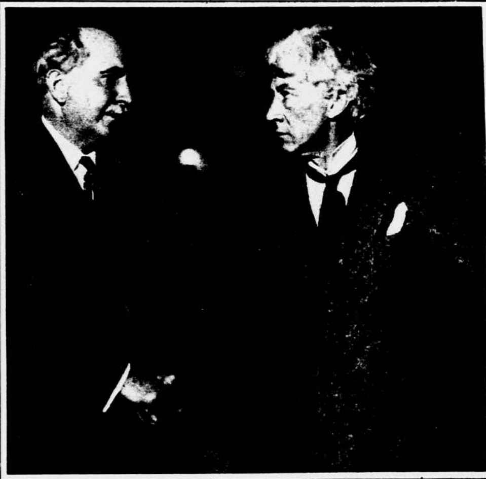
Judge Kenesaw Mountain Landis bids good-bye to his court clerk in Chicago and prepares to devote all his time to oiling the machinery of organized base ball. Judge Landis served seventeen years on the bench and was known for his fearless decisions.