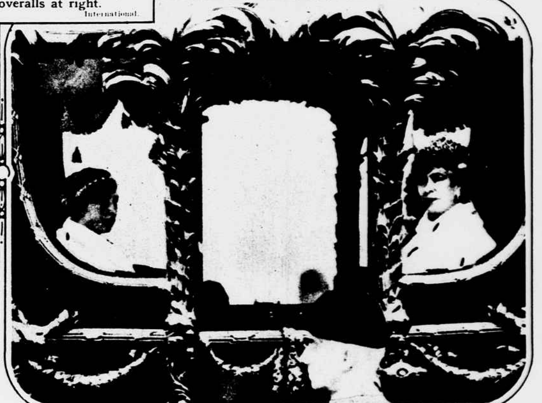
The Queen of England and Princess Mary in the historical royal coach, which will be used when the princess becomes the bride of Viscount Lascelles in Westminster Abbey. Photo made at the time of signing of the peace pact with Ireland.