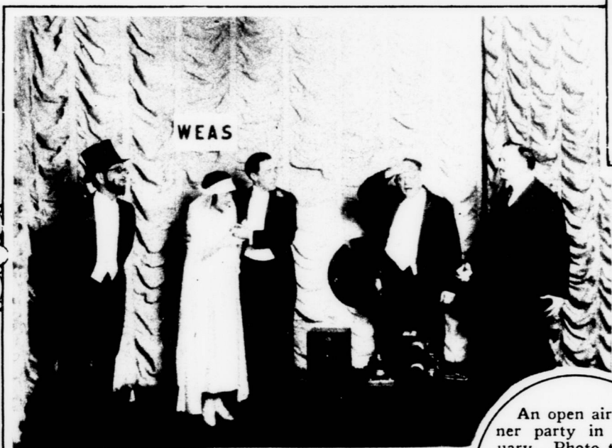
The funny lines from "Abie's Irish Rose" are broadcasted from the Hecht Company's station in Washington. This was the first time a stage play was ever broadcasted.