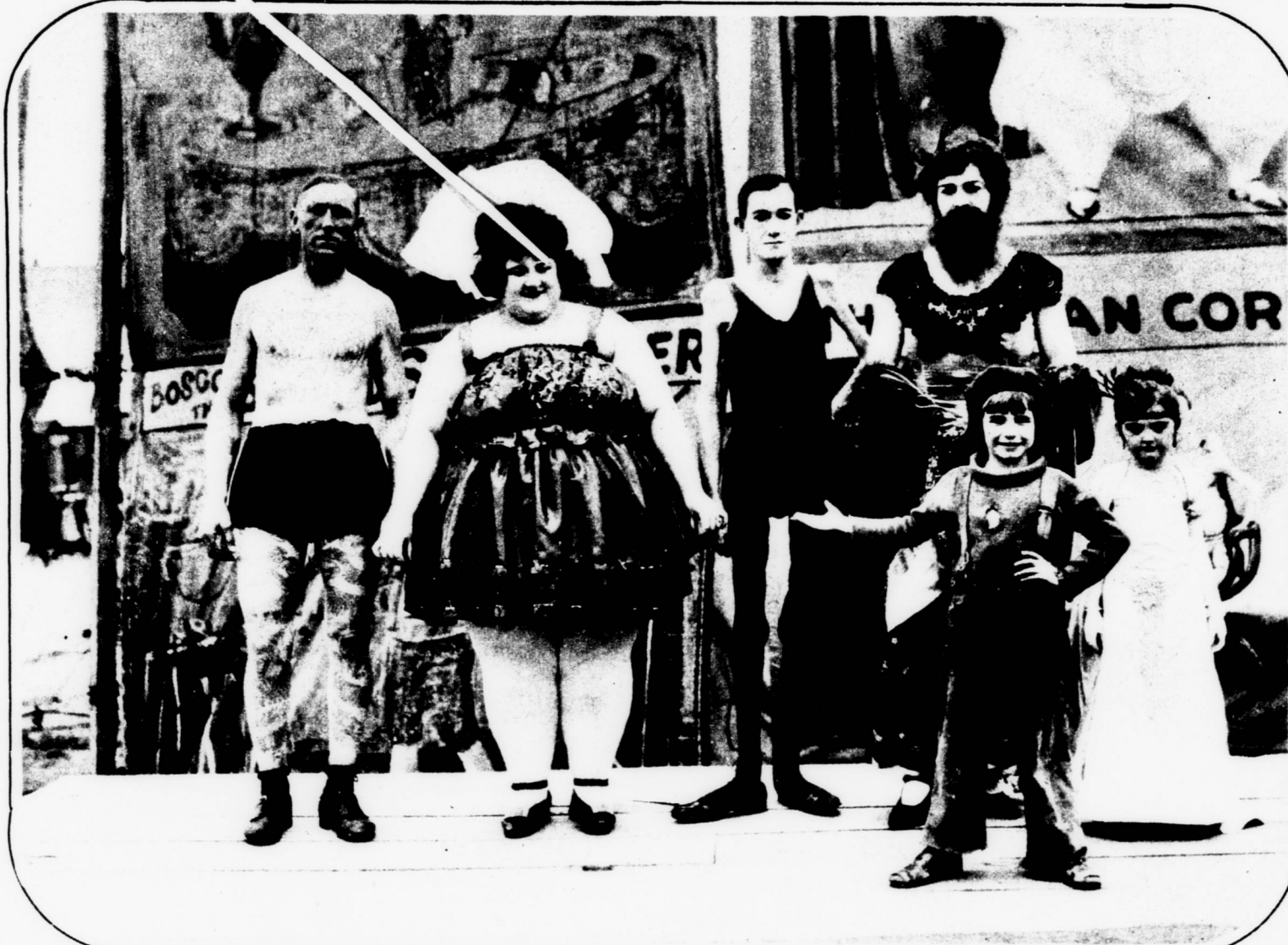
The bearded lady, the fat girl, the living skeleton, the tattooed man and the midget all "work" in Jackie Coogan's newest photoplay vehicle, "Toby Taylor." And Jackie had this picture posed especially for the movie-fans.