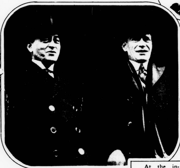
At the inauguration of the new Governor of New Jersey, Gov. George S. Silzer at left and Senator Edwards, former governor, at right.