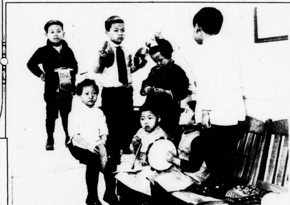
Chinese children in New York's baby show have a little orchestra all their own.