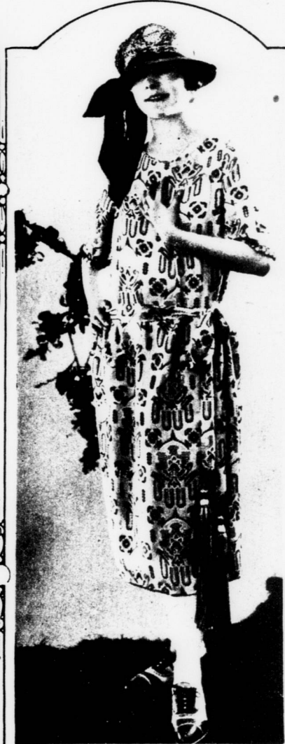
A frock for southern wear. It is made of gray material with a striking pattern in red. The hat is trimmed with a brilliant bandanna handkerchief.