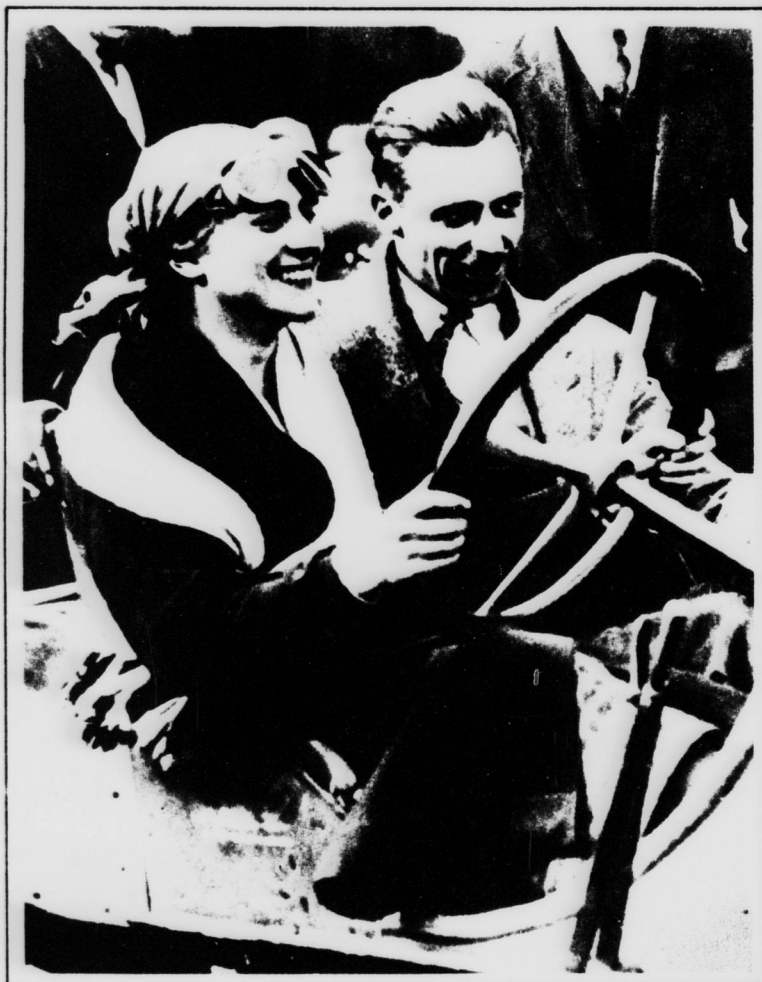
Miss Violet Cordery, 23-year-old English racing driver, at the wheel of the car in which she recently broke the English time record for a 5,000 race at Montlhery. She was awarded the Dewar trophy against five other competitors in the race.