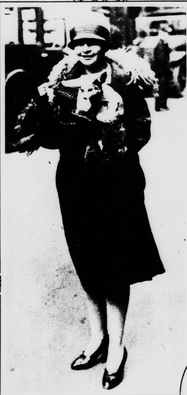
The latest Parisian pet. The small animal is a fox dog, a cross between an Algerian dog and a Moroccan fox. Parisian ladies of fashion are paying fabulous prices for them.