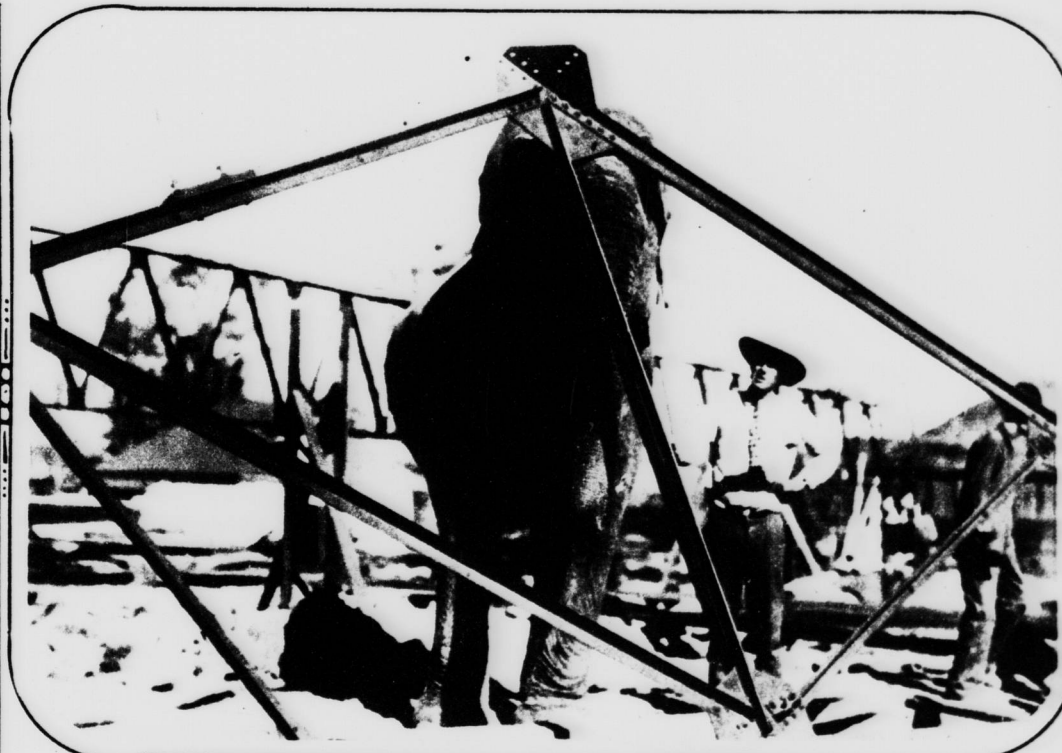
Queen Tessie, four-ton pet of a contractor at Colorado Springs, Colo., earns her daily three bales of hay by moving iron frames and doing other odd jobs in construction work.