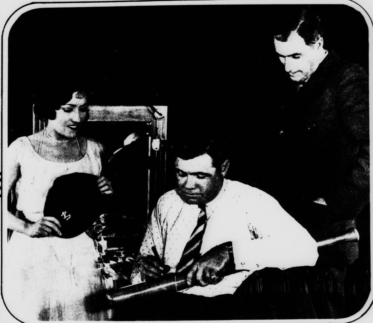
Babe Ruth, home run king, autographs one of his base ball bludgeons for Gloria Swanson in appreciation of her lessons in the art of make-up. The screen star and "Big Bill" Tilden, deposed tennis champion, look on.