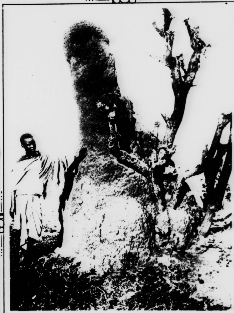
An insect of Abyssinia closely related to the grasshopper family built this sky-scraper for a colony home. The mound is of hard clay perforated with small holes used by the insects as doors to the inner chamber.