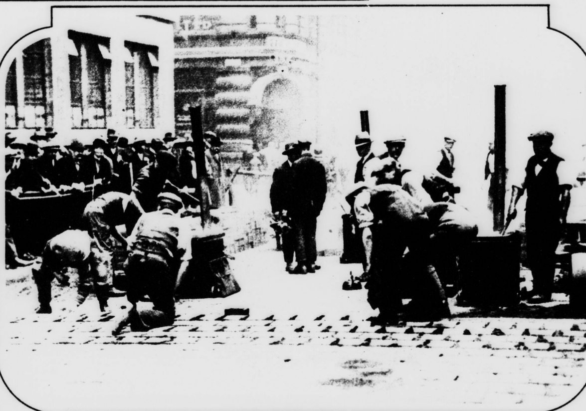
Rubber bricks are being tried in London, England, in the effort to find a paving material that will stand up under modern traffic. The bricks are being laid here in New Bridge street.