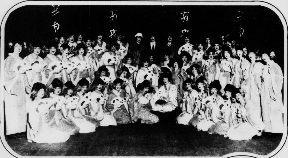
Members of the Wilson Normal School Glee and Dramatic Clubs in the costumes of their recent presentation of the picturesque opera, "The Japanese Girl."