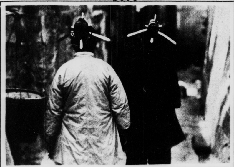
A relic of the past. This silver sword headdress, still worn by women in the Fochow district of southern China, is said to have originated from the old custom of women thus carrying swords to protect themselves from bandits descending from the hills.