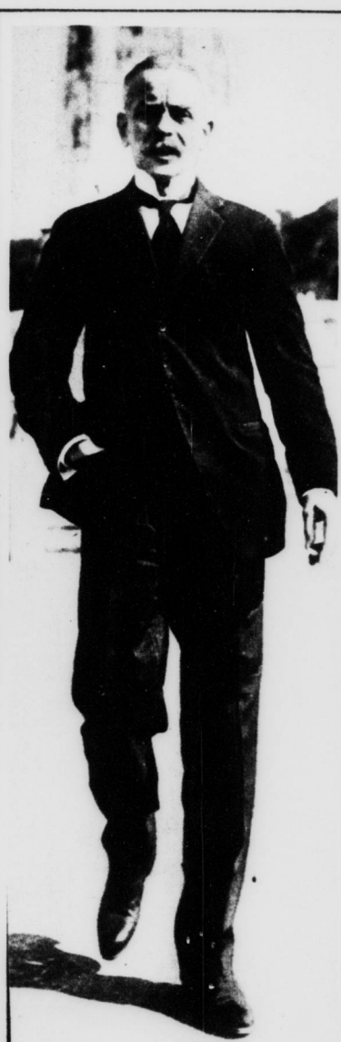
This snapshot of Gen. Carmona, Portuguese President and military dictator, was made just after the termination of the last revolution, which he successfully suppressed.