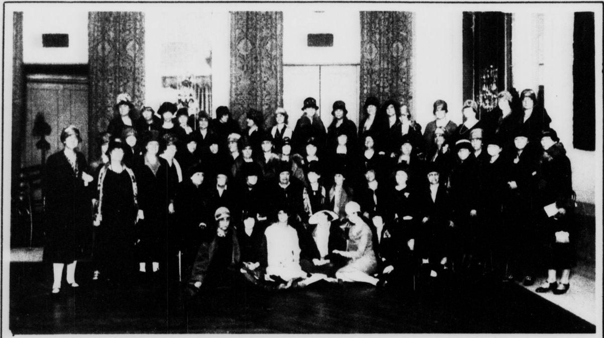
Members of division "A," the leading division in the Casualty Hospital building fund campaign.